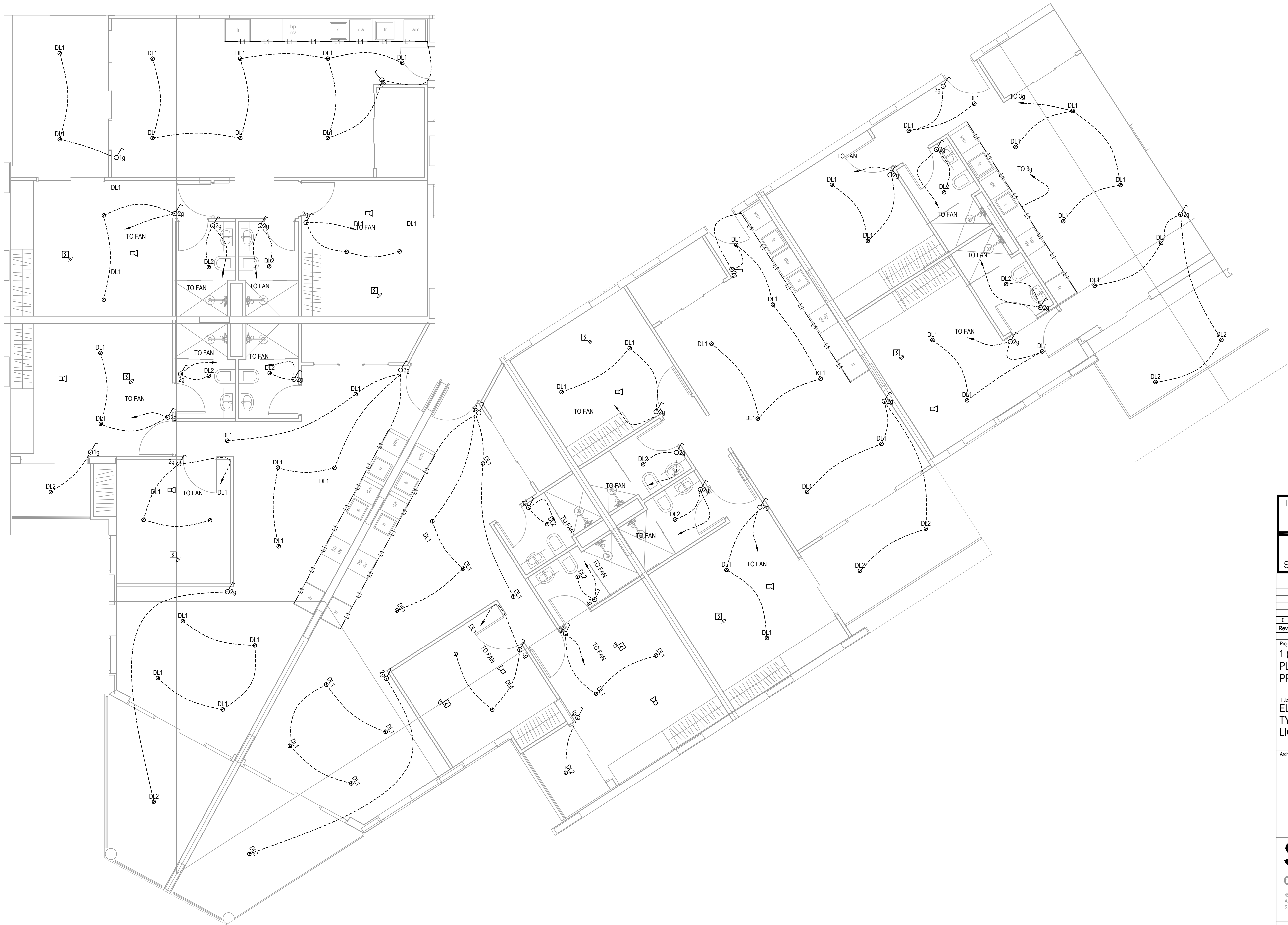
TYPICAL APARTMENTS TYPE D-H SCALE 1:100